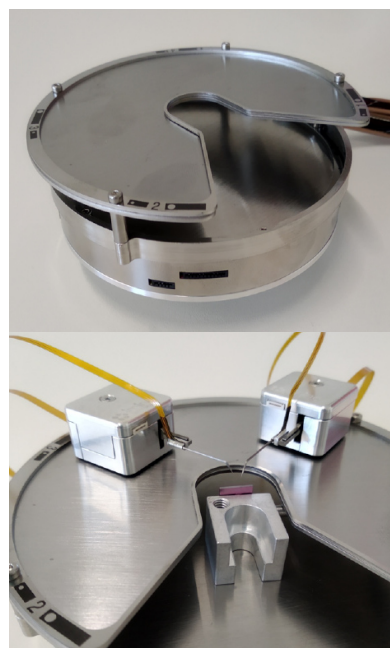
Figure 3. Imina Technologies' Large Sample Adapter mounted on the Nanoprobng Platform (left). The sample attached to the polishing cross-section paddle is placed at the center of the assembly (right).